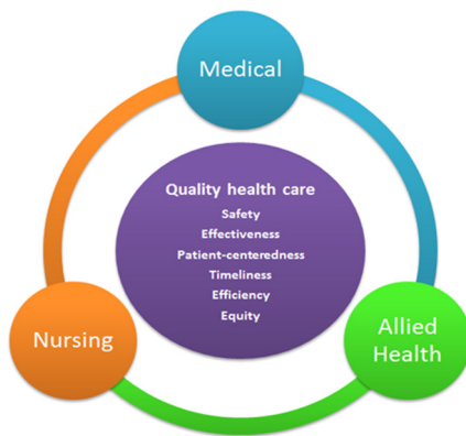
Fig. 1: An overview of the role of allied health in contemporary healthcare.

It is in this context of “change” that, all professions within the health system can play an important role. Historically, the professions of medicine and nursing have played an important role in delivery quality healthcare, especially given the focus on mortality and acute health conditions threatening the population during those times. Recently though, while life expectancy continues to grow, so does the prevalence of chronic conditions, obesity and NCDs. This coupled with meagre resources, shortages of health professionals and an informed consumer means contemporary 21 st century healthcare requires innovative thinking and actions. Successfully meeting these challenges to the health system will require all professions within the health system including allied health professions (Figure 1).