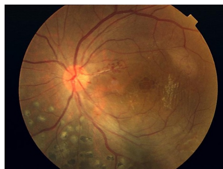
Fig. 5 : Fundus photo of left eye showing a telangiectatic vessel temporal to the optic disc with cystoid macular oedema post vitrectomy.

quiescent. The patient subsequently underwent pars plana vitrectomy (PPV) with vitreous washout and endolasers. Post operatively, fundal examination revealed a telangiectatic vessel temporal to the optic disc with cystoid macular oedema (Figure 5). A repeated FFA showed leakage from the telangiectatic vessel near the optic disc and confirmed the cystoid macula oedema (CMO). Patient was subjected for top up PRP along with topical ketorolac. The CMO was recalcitrant, along with development of nucleus sclerosis cataract. The patient opted for no further intervention. Her final best corrected