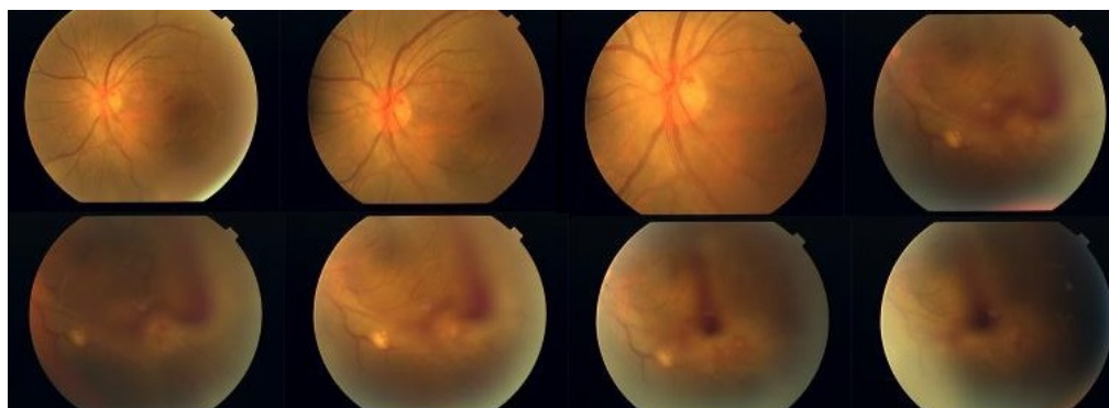
Fig. 1: Fundus photo of left eye showing the vascularised inferotemporal retinal astrocytoma with vitreous haemorrhage.

features suggestive of tuberous sclerosis which include adenoma sebaceum, hypomelanotic macules (ash leaf spots), shagreen patch and ungula fibromas. On ocular examination, the visual acuity was 6/6 OU with N5 near vision. The anterior segment examination was unremarkable with intraocular pressure (IOP) of 16mmHg bilaterally. Fundus examination of the left eye revealed a vascularised astrocytoma inferotemporally with vitreous haemorrhage inferiorly (Figure 1). There were also presence of new vessels at the optic disc and inferotemporal arcade vessels. The remaining astrocytomas looked benign. The right fundus revealed similar findings of benign looking astrocytomas (Figure 2). Based on the general physical and ocular findings, a diagnosis of aggressive retinal astrocytoma with proliferative retinopathy af-