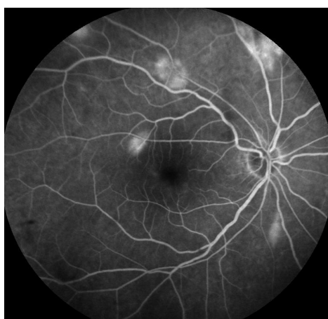
Fig. 4: Fundus fluorescein angiography (FFA) of the left eye showing presence of multiple staining hyperfluorescence areas corresponding to the benign retinal astrocytomas.

visual acuity (BCVA) was 6/36 OS, N18 while 6/6 OD. The patient has been on follow up for the past 11 years and the visual acuity and fundus findings remained the same.